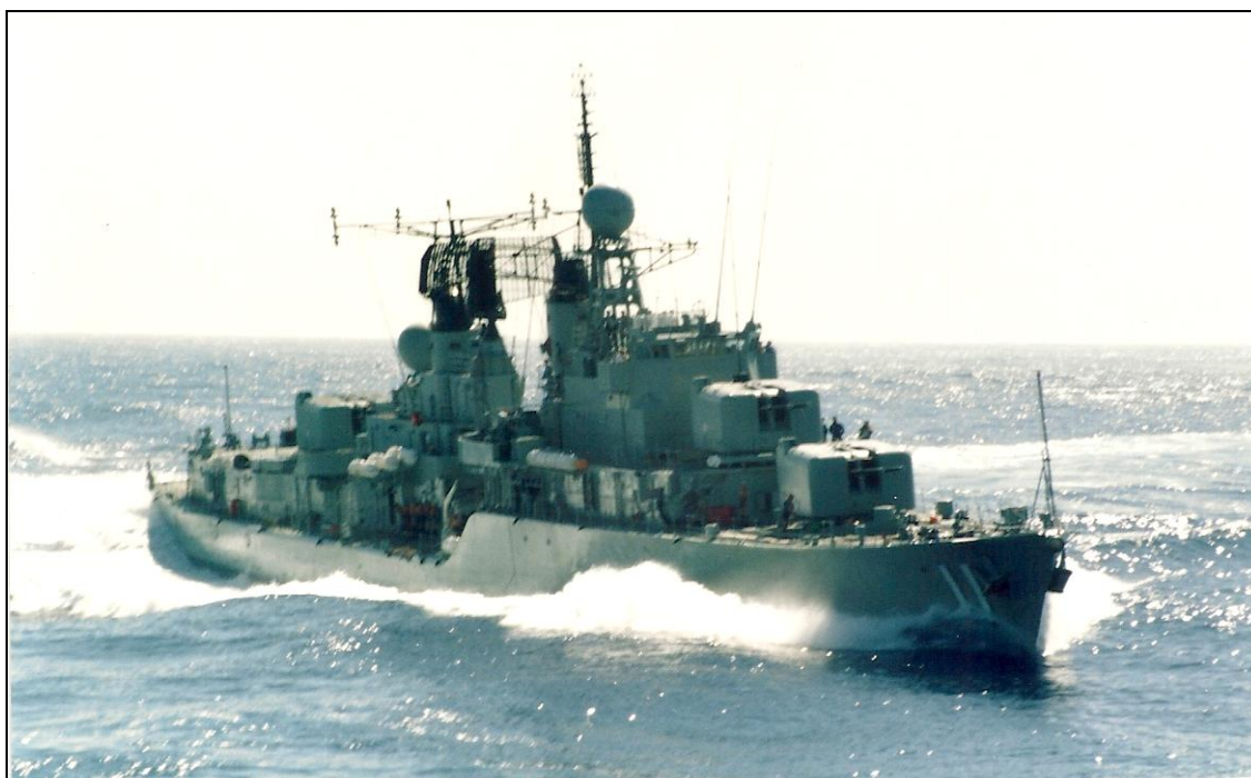
HMAS Vampire off the NSW South Coast 14 March 1986

If you have a photo to share please send it to callthehands@navyhistory.org.au