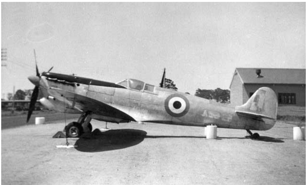
Spitfire V A58-211

In October 1948, 15 ex-RAAF Spitfires were transferred, by truck, to the RAN and delivered to the Naval Air Station – Nowra (NAS –Nowra). There was 1 Mk VC and 14 Mk VIII