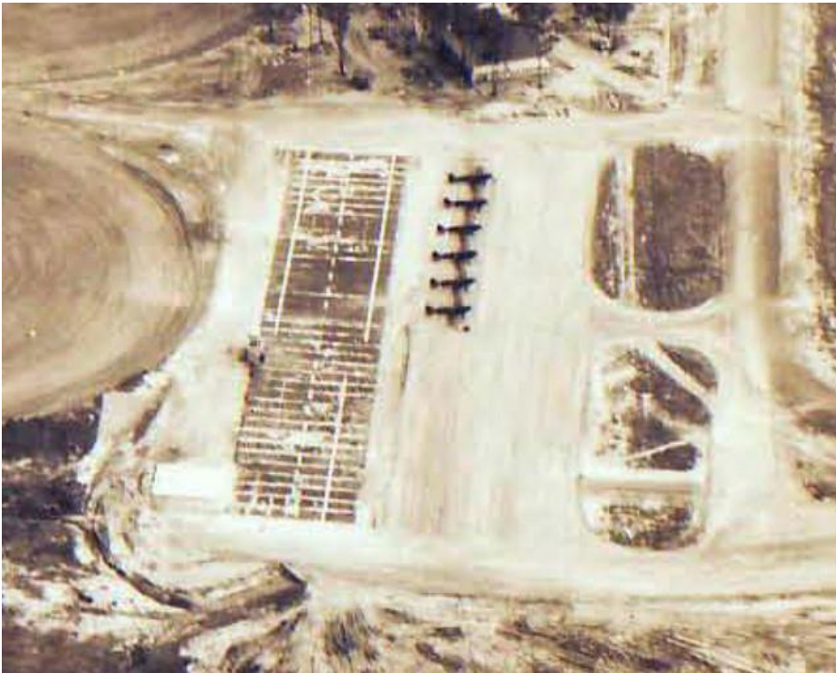
Spitfire deck handling trainers: Aerial view of dummy deck at NAS Nowra