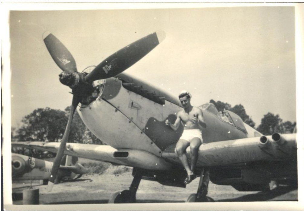
Spitfire VIII A58-691

This enabled the flight deck crews to learn their trade ashore with real aircraft before being sent to sea. Aviation mechanics would run the engines for practice and also taxi the aircraft around the dummy deck. This gave the aircraft handlers and others a chance to experience the problems and dangers of working close to aircraft with noisy engines and spinning propellers. None of the Spitfires were air-worthy and were only maintained to ground run status.