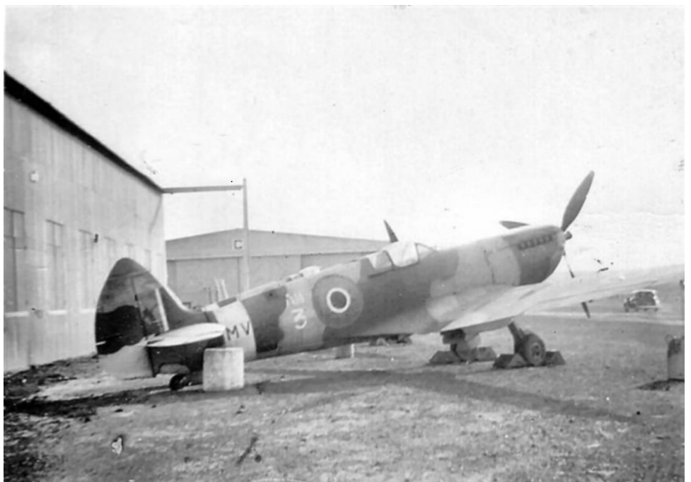
Spitfire VIII A58-752

In 1952 the aircraft were no longer required and later transferred to the NAS Nowra fire ground where they were used for training flight deck crews in extinguishing aircraft fires. The remains were reported to have been buried at Nowra.