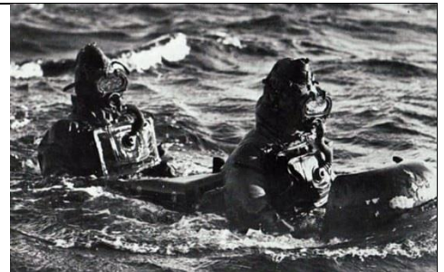
A maiale breaking the surface