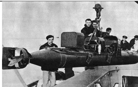
A manned Torpedo with Crew members