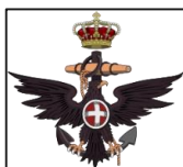
Regia Marina WW2 Italian Navy