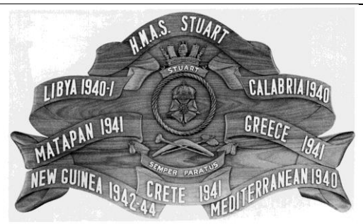
HMAS STUART (1), battle honour board